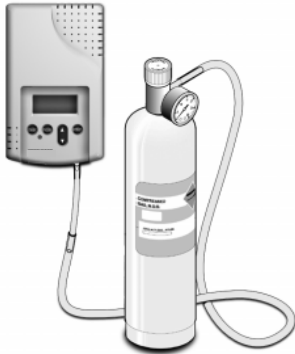
The illustration shows the complete set-up for calibrating the Ventostat® 8002W.